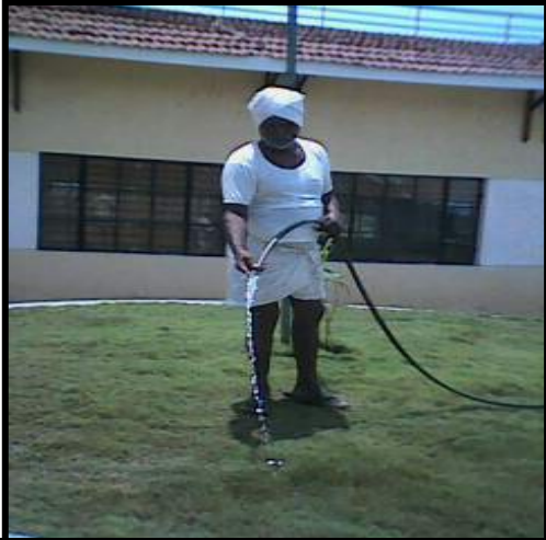
Elders are assigned a return takes our residents are actively involved in taking care of greases by regular watering