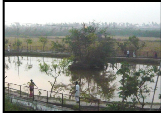
Morning walk by our Residents, Now a days most our elderly are doing morning walking.