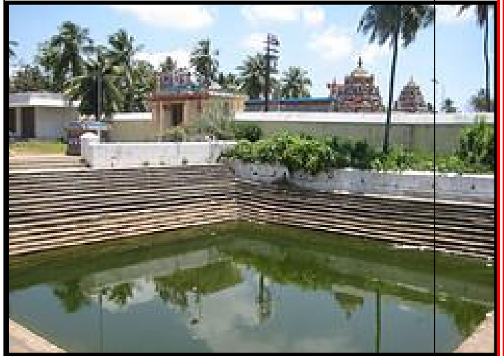
Shri Lakshmi Narashmma temple visit at singakiri for TEV