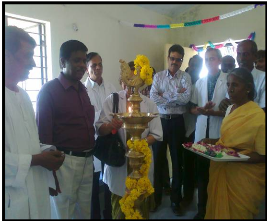
World Health Day Celebration at TEV For Cheep guest MGMCRI, and Cuddalore RMO.